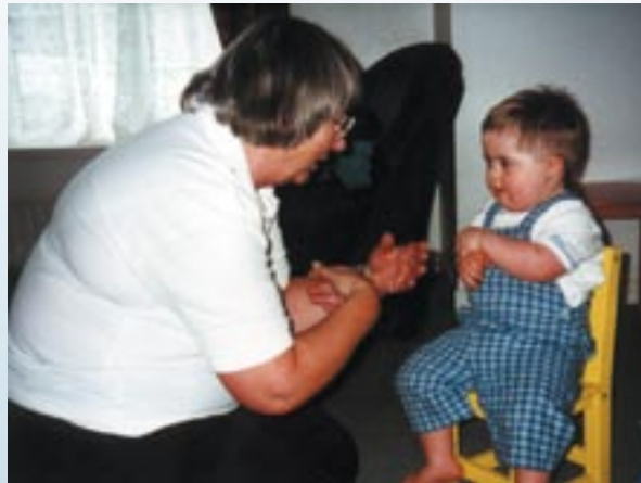
This shows Home Visitor working on this week's teaching activity.