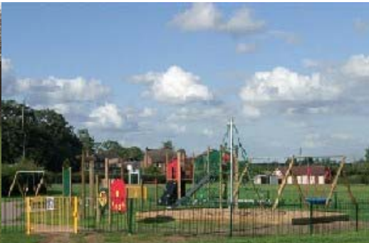
Belton play area – before and after