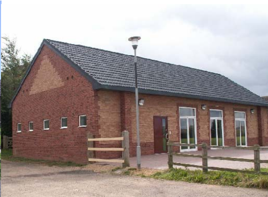
Sapcote pavilion – before and after