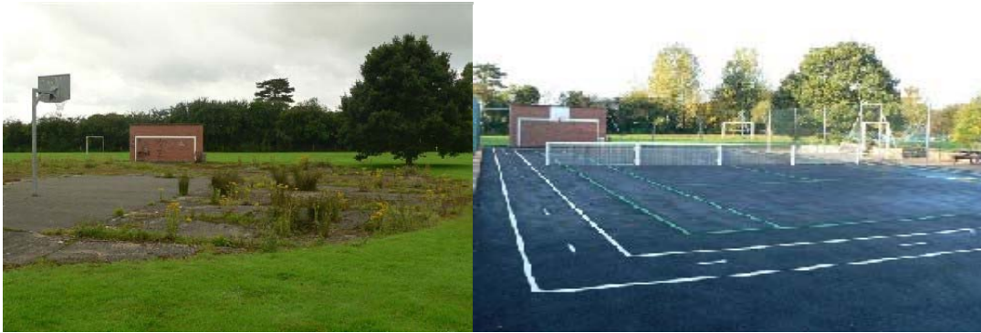
Hoton recreation ground – before and after