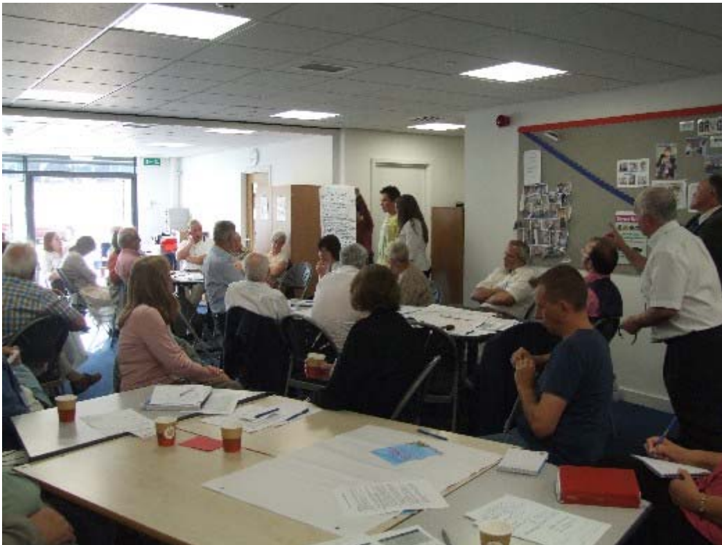
Community forum workshop