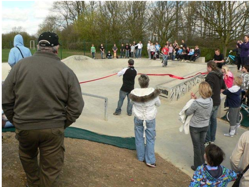
Fleckney skate bmx park opening