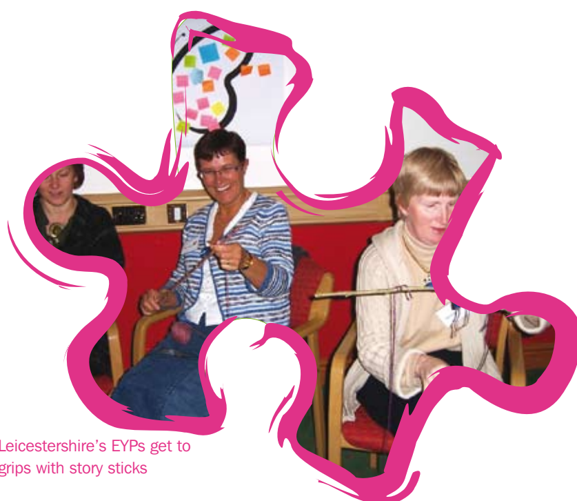
Leicestershire's EYPs get to grips with story sticks

If you are interested in becoming an Early Years Professional contact the Workforce Development team on 0116 305 6555.