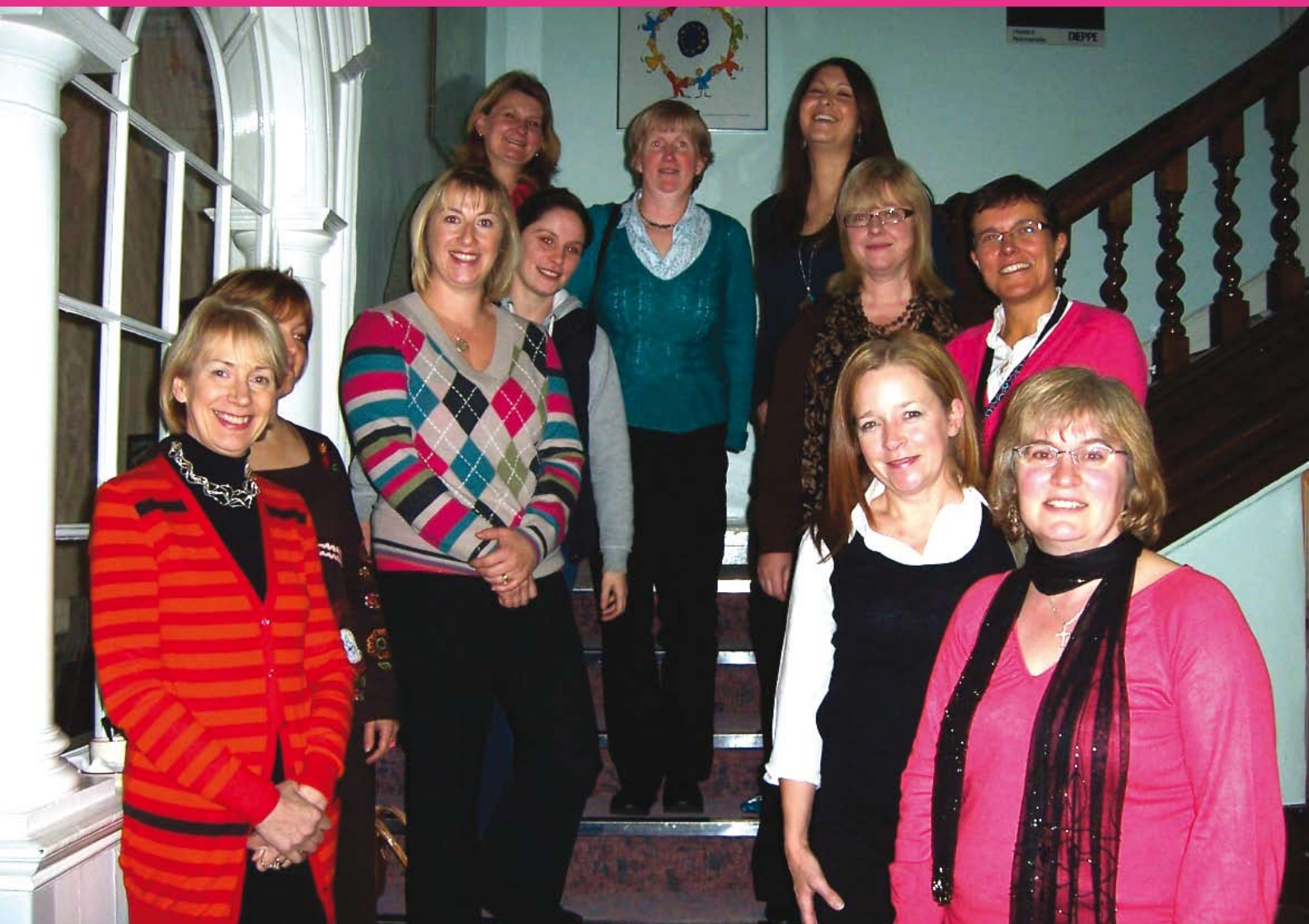
Leicestershire's EYPs meet to discuss the network

The day was rounded off by some storytellers who encouraged us to tell our life story on a stick!