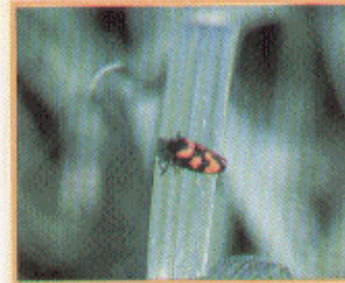
Red & Black Froghopper