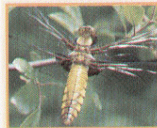
Broad-bodied Chaser Dragonfly