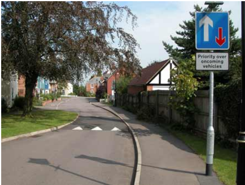
Figure GL3 Example of a shuttle-working speed control feature

where it is controlled by temporary traffic signals. But shuttle working can also be used to help control vehicle speeds as part of a traffic-calming scheme, as shown in the example below.