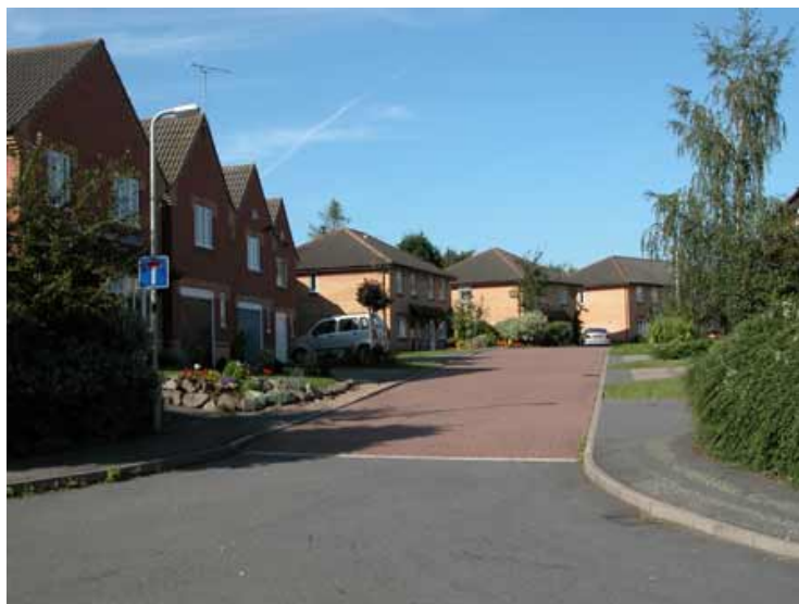
Figure GL1 Example of an entry ramp

Entry ramp: An upward sloping ramp used at road junctions. Located at the start of the side road, the ramp controls the speed of a vehicle that has turned from the main road into the side road.