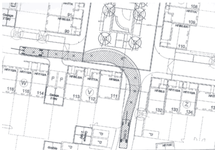
Figure GL4 Example of tracking.

Tracking: Tracking is providing the required width for vehicle movement within the overall width of the road. It can also be used to establish an appropriate bend radius. Instead of taking the highway engineering requirements as the starting point for layout design, you can consider the arrangement of the buildings and the boundaries of the development first. You can lay out buildings to suit a particular form, with kerblines helping to define and emphasise spaces. The width between kerbs can vary. (You can find further information on how to use tracking in 'Places, Streets and Movement', published by the Department for Transport).