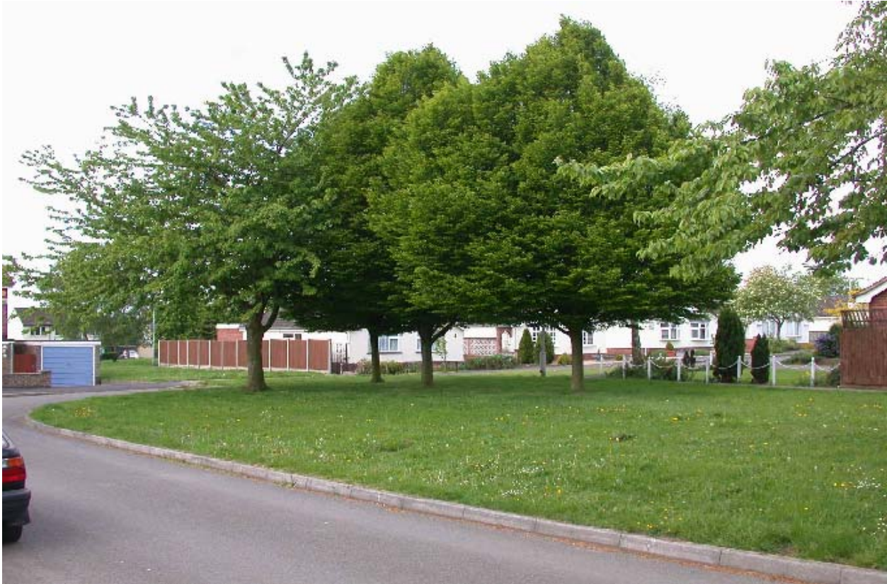
Figure L1 A mixed-tree group on an area of open space, well away from house frontages