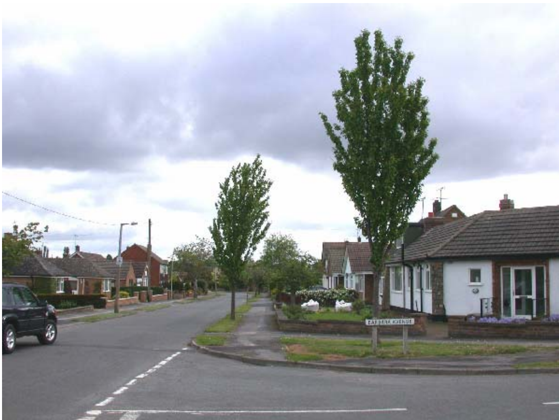
Figure L2 Fastigiate cherries planted in a narrow verge do not spread into neighbouring property or over the highway