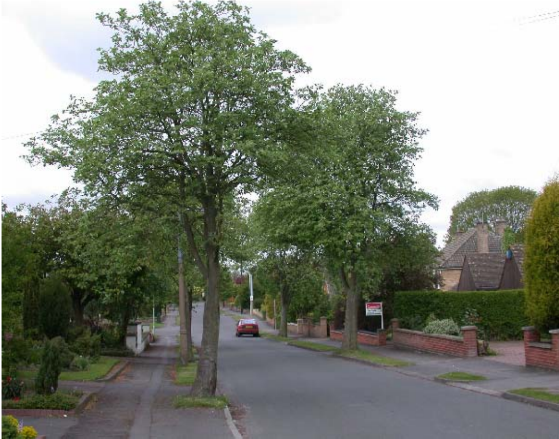
Figure L3 Trees planted in very limited subterranean space, affected by service trenching and outgrowing their site. This causes a maintenance problem for the highway authority