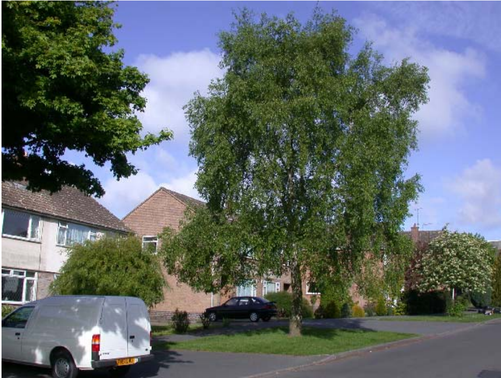
Figure L5 Correct tree selection. Silver birch on a reasonable verge area allows sunlight through to the house frontage.