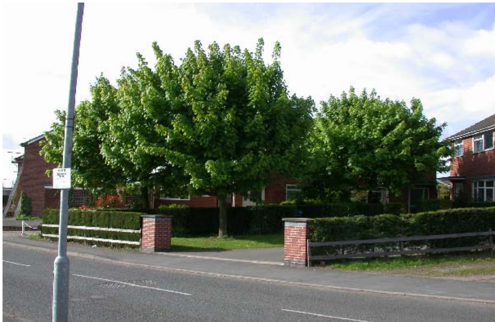
Figure L6 Poor tree selection. Three Norway maples, at approximately one-third of their potential size in small gardens, completely dominating the house frontages.