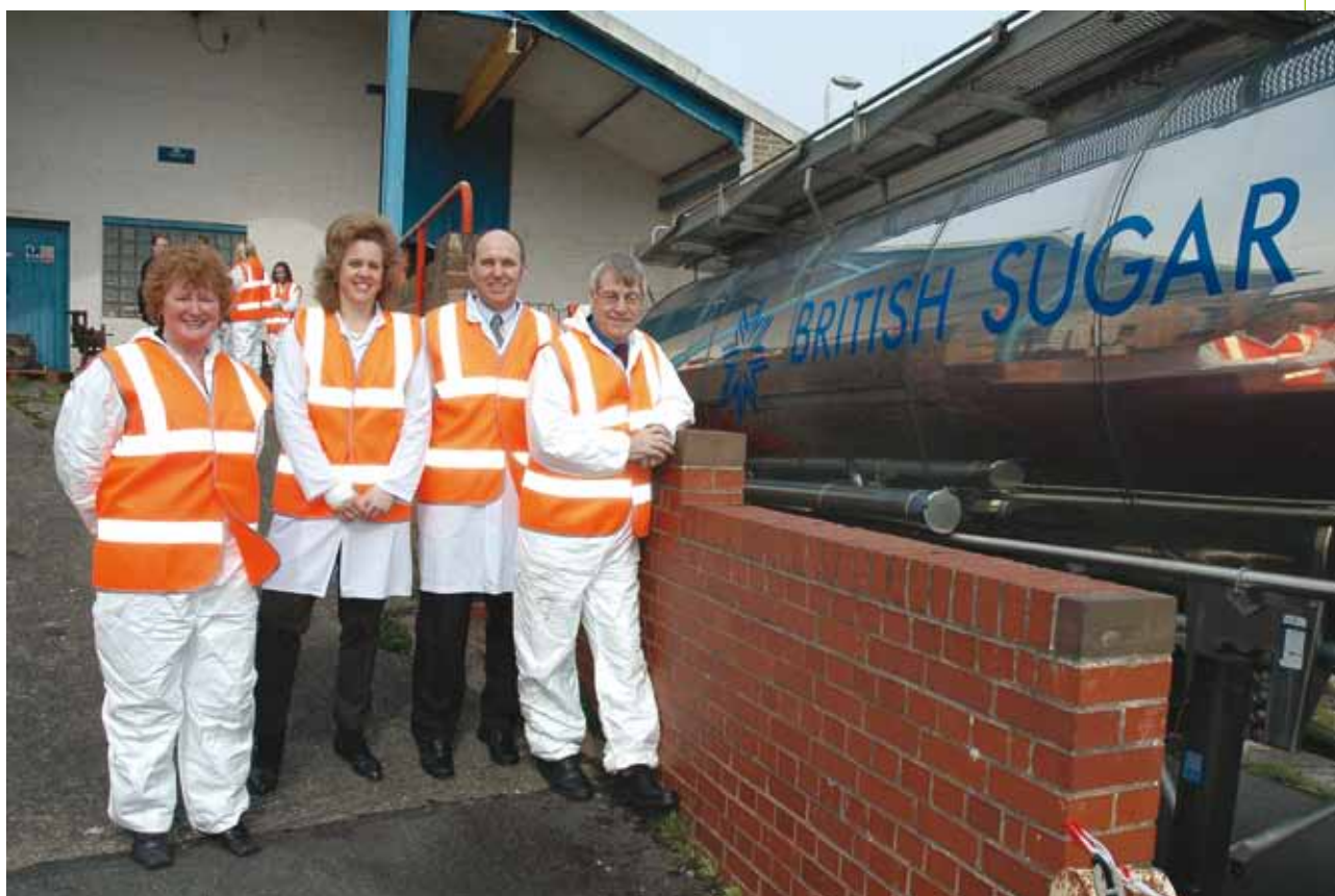
A new donation of sugar

This is now the final phase of conservation, involving the controlled drying of the timbers. Later in 2009 options for the interpretation of the timbers, their access and display, will be considered as part of Snibston's revitalisation programme.