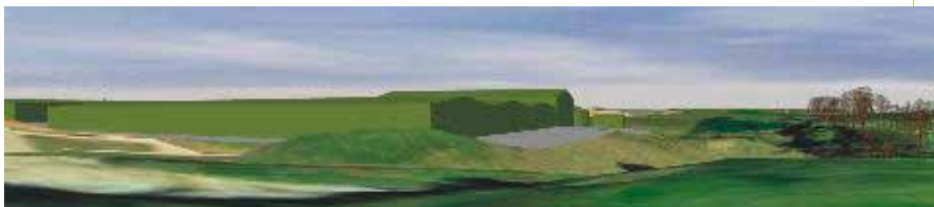
Waste facility granted planning permission at Shawell

Close liaison with the County Council waste procurement process has taken place over the year, particularly in terms of the procurement for a major waste facility. Additional resources have been provided to meet the demands on the service in this area of work. The service has also been heavily involved in the Waste Implementation Programme Board and projects in order to assist in the delivery of county waste facilities.