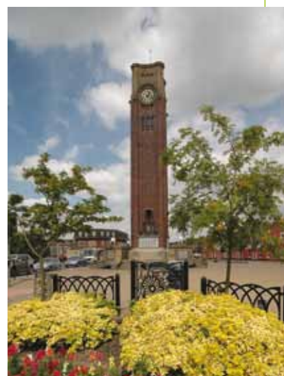
Coalville War Memorial

We have been involved in the early stages of a countywide project to document war memorials – their design and condition, the history of the people named on the memorial, the history that lies behind the decision to erect a memorial – working with the Heritage Wardens network. A pilot study of the memorials in Croft and Coalville has led to the development of a resource pack for potential researchers.