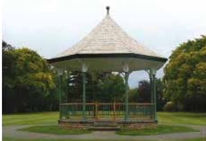
Melton Bandstand restored to its original splendour through the Melton PSICA project

Under a separate scheme especially for Melton town centre a partnership of funding from the County, English Heritage and Melton Borough offered nearly £90,000 of grants to nine historic buildings in the town centre within a total restoration budget of £143,000.