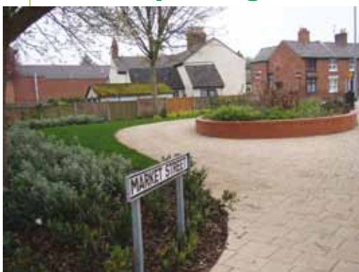
Sensory Garden, Ashby de la Zouch

Work includes advisory inputs, outline and detailed design, contract preparation and contract supervision, and has been undertaken for a wide range of scales and types of scheme including: