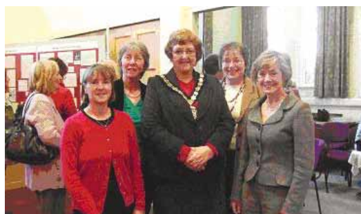
Opening of What Bard Hath Sung of Thee? One Hundred and One Women in Leicester