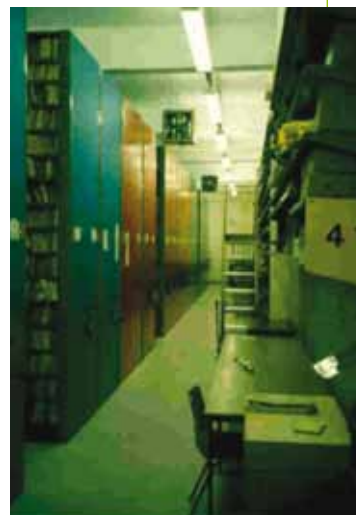
New storage space has been obtained