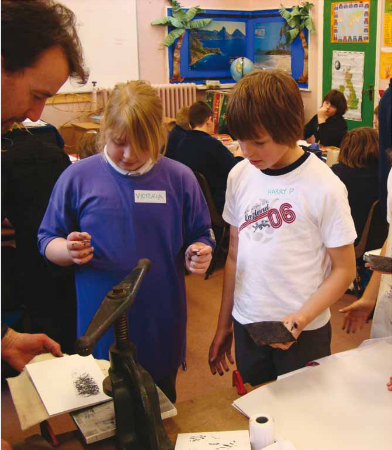
Artworks and Resource box activities

To play a significant role in the improvement of local community wellbeing, to protect and enhance the county's environment and heritage, and to improve access to recreational and learning activity and resources, for the people of Leicestershire, its visitors and for future generations.