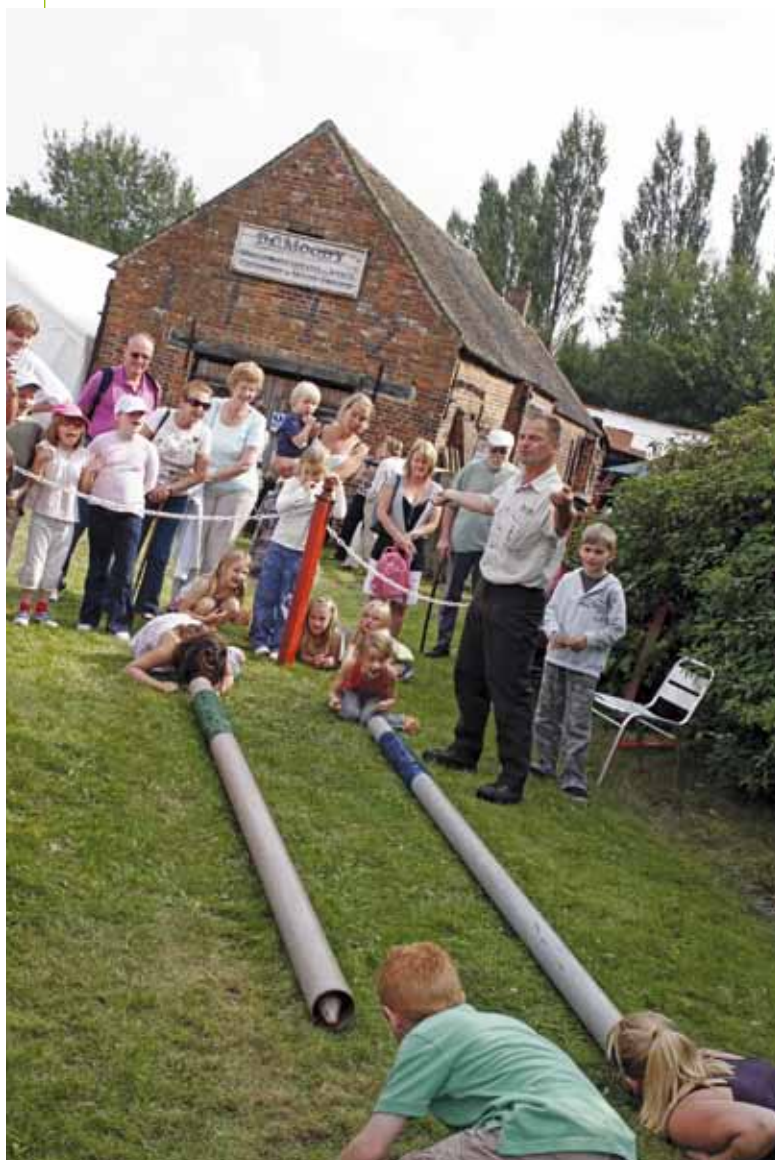
Snibston, Miners Gala 2008, Ferret Racing