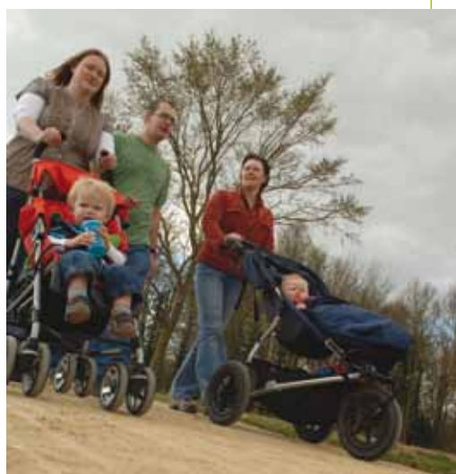
Access for all at Market Bosworth Park

Rights of Way staff have continued to implement the Action Plan set out in the Rights of Way Improvement Plan. At the heart of these proposals is encouraging and engaging with more people and a broader range of the population. The group is seeking to increase levels of walking and riding in all sectors of the community and contribute towards raising physical activity levels