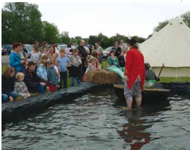
Wildlife on Your Doorstep

Stepping Stones (a partnership project with five District Councils) organised a range of activities and events including a successful community and private environmental grants scheme, rural skills training, and the third Wildlife on Your Doorstep event at Watermead Country Park. Stepping Stones officers and other team members also supported the Tree Warden network of 131 parish based volunteers with training courses, advice, and a Free Tree scheme.