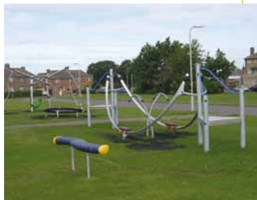
Blackbrook Play Area – FLAG Scheme