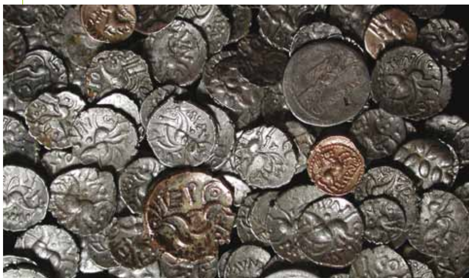
Some of the Treasure

The project will also include a re-display of Harborough Museum's displays about the town and the locality. Many old favourites from the collections will still be available and some items previously in store will be displayed. The Treasure itself will be housed in a rotunda in the centre of the Museum gallery. There will be six modules, each of which will look at an aspect of the Treasure. Each module will include a display case, a game or puzzle, text and images about the finds, and sources of further