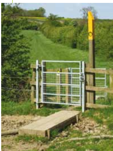
New Gates at Gumley

To keep paths open during the summer months, the crop monitoring programme has proved very successful. More than 400 paths were surveyed and in all instances paths were kept clear by farmers without the need for final formal action. Also, the Headland Management programme continued to support the local cutting of headlands with grants alongside the wider programmed clearance programme.