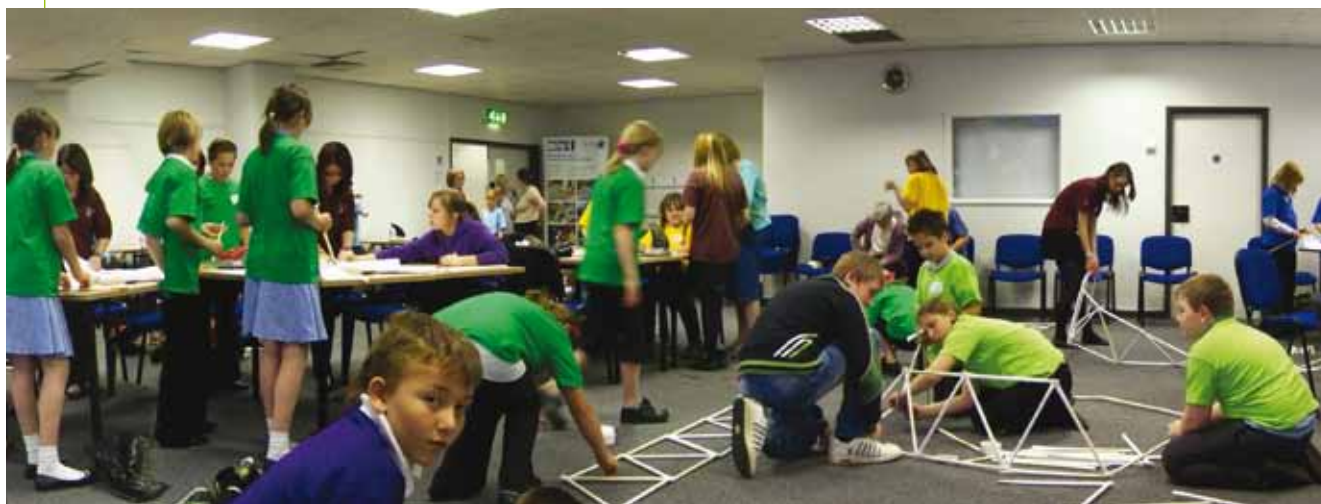
Structural Engineers Challenge Day for Schools at Snibston

The economic regeneration of the site and Coalville Town Centre are inextricably linked in this project, and training, skills and volunteer development, increased visitors and tourists to the area and overnight stays in the National Forest will enhance economic outputs. Enhanced community cohesion and greater sense of identity and place for local communities will be an important outcome of the Mining Lives project.