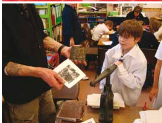
Artworks and Resource box activities