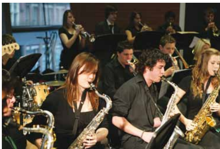
Find Your Talent Launch event