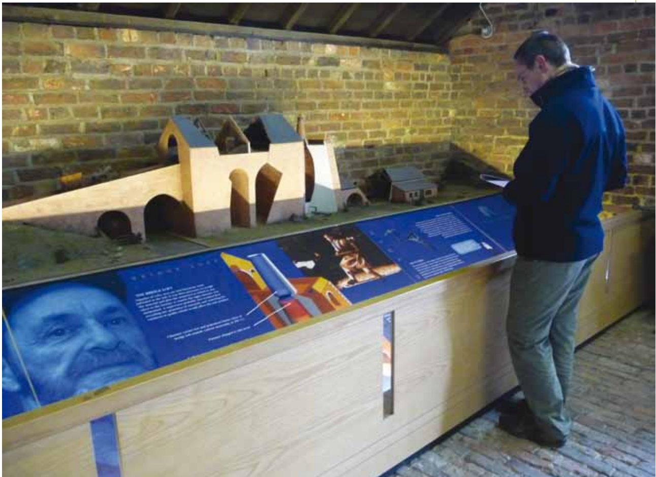
Behind the Scenes - using Moira Furnace displays for inspiration