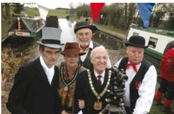
Launch of Ashby Canal Extension