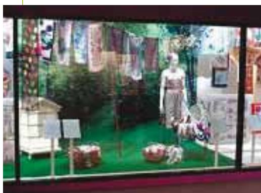
Scarf Hoarders Exhibition at Snibston