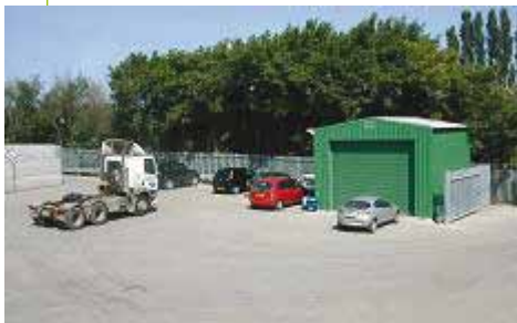
Enforcement at a waste transfer station

This year also saw the roll out of electronic submission of planning applications through the planning portal and the development of validation check list. Planning Delivery Grant of £151,835 (compared to £53,920 last year) was awarded for planning achievement. Progress on a replacement PLANCON system was progressed during the year by the use of a business analyst. Implementation is to take place during 2009/10.