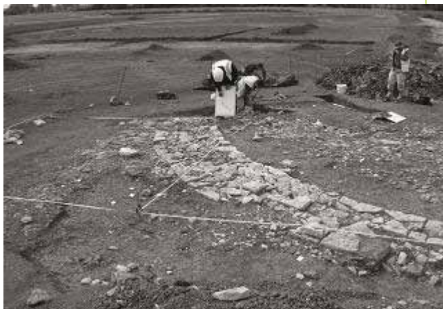
Roman settlement near Rutland Water

The Historic Landscape Characterisation (HLC) project came to the end of the data recording phase and entered the analysis phase. This scheme is funded with help from English Heritage and has been completed to the highest standard and will provide an invaluable new resource for the county's and districts' built and countryside planning. A woodland opportunity map was produced as one example of the HLC's immediate use. Members of the team gave papers at HLC and regional conferences. The team made sure the county's historical environment information was part of the Strategic Housing Land Availability Assessment (SHLAA) process.