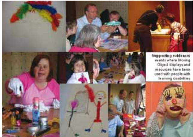
Open Museum - Moving Objects