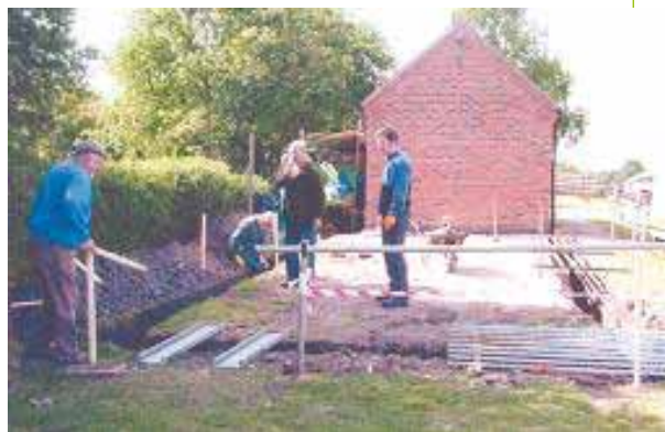
Volunteers at Swannington Heritage Trust

The one year temporary post of Volunteer Coordinator became a permanent one in September 2008 and although originally attached to Arts & Heritage, is now based within Commercial & Support Services. The Volunteer Coordinator role continues to have both a developmental and a strategic aspect with the Council's volunteering programmes and to cover the whole of Community Services in Leicestershire.