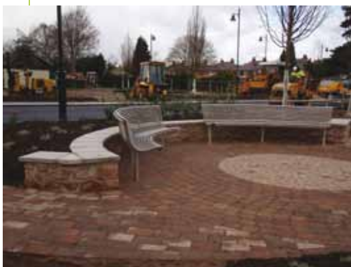
Birstall Car Park Extension