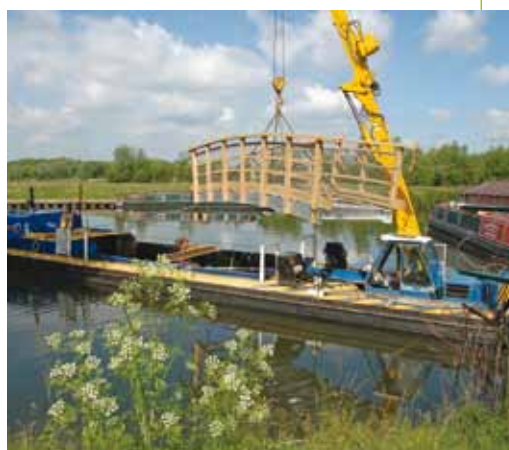
New Canal Bridge at Watermead Country Park – Connect 2 Project