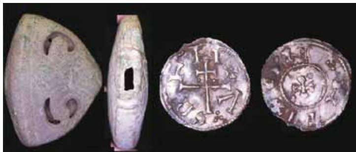
Sword pommel (second from left) and Kingdom of York silver penny