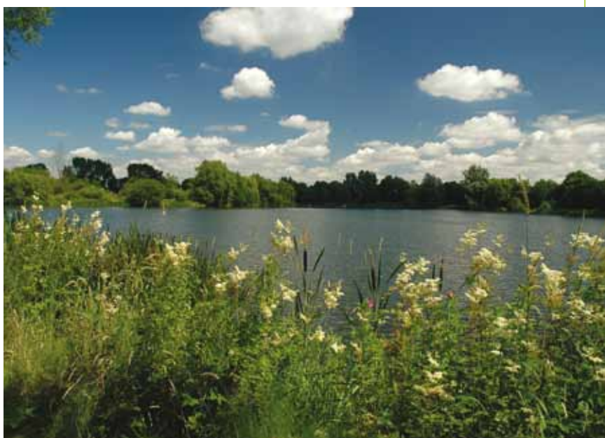
Watermead Country Park

Noteworthy projects include the further development of Ashby Canal, Watermead Connect2 and plans for a visitor centre, museum redevelopments at Melton and Harborough and the restoration of the scheduled colliery monument at Snibston. Projects such as these have become catalysts for further regeneration benefits, and our volunteer programmes are already successful. Engaging young people in particular the unemployed, is a real opportunity for the Service, and the partnership with Stephenson College, Coalville, Leicestershire Together and Snibston has enabled a range of volunteer, apprenticeship, and work placements to be made available.