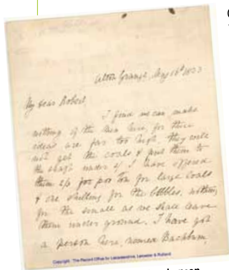
Letter from George Stephenson

One of the year's most significant purchases, with the support of the V&A Purchase Grant Fund, was a letter of George Stephenson to his son, proposing the development of a major colliery at Snibston. The letter disparages local labour ("we can make nothing of the men here") and suggests the recruitment of miners in Newcastle.