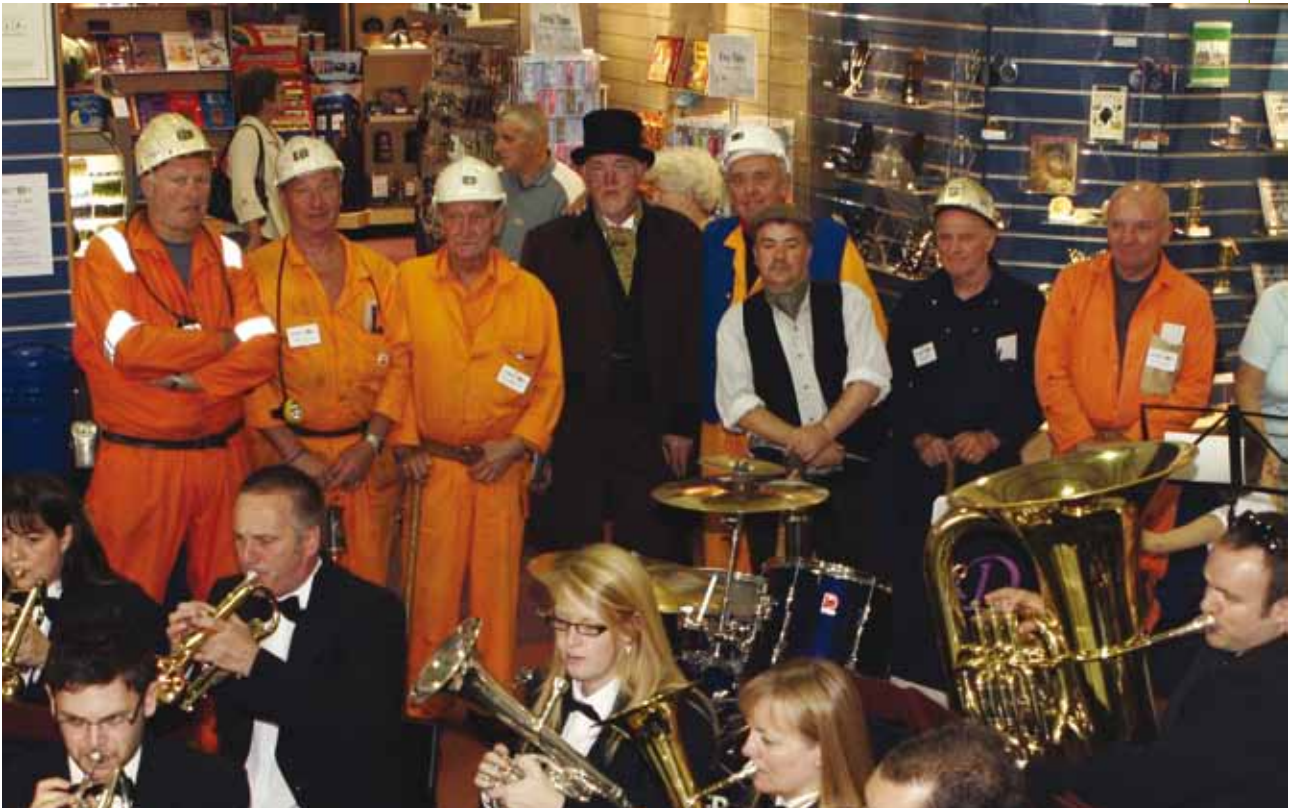
Miners Gala 2008, Snibston