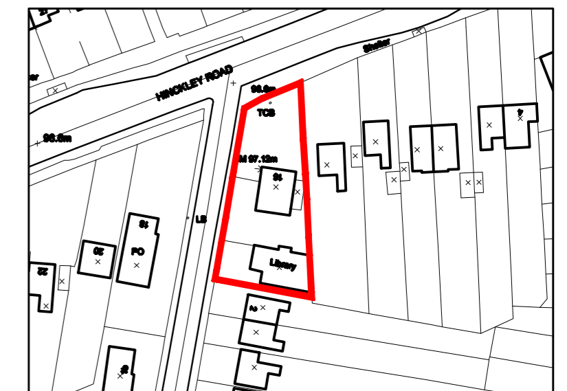
Proposed Site Area (1:1250)