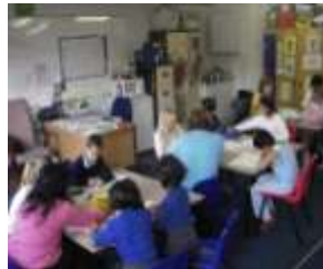
Reading and Writing