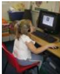
Learn English on the computer

At 12.00 we have lunch at school. Some children buy a hot dinner from the kitchen. Other children bring food from home.