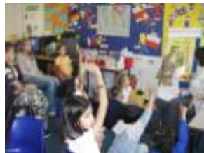
Listening and speaking