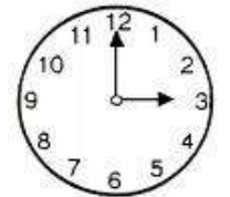
We close at 3.00pm