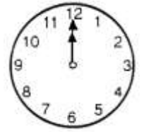
We have lunch at 12.00pm

Some children have some writing for homework. You can help them with this if you like.