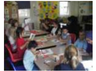
English for Arts and Crafts