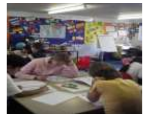
English for Maths