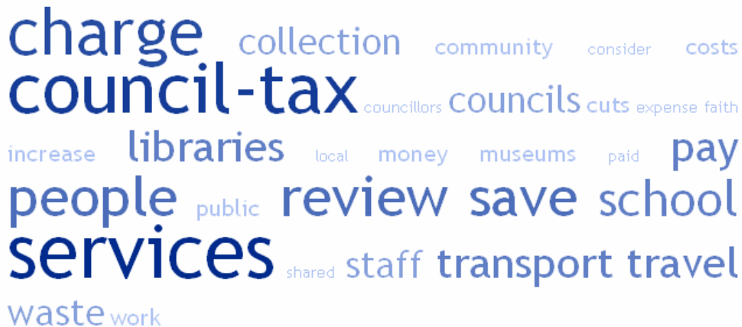
Tag Cloud represents the thirty most re-occurring words. Removed: 'services', 'cuts'. Joined together: 'Council' and 'tax'.