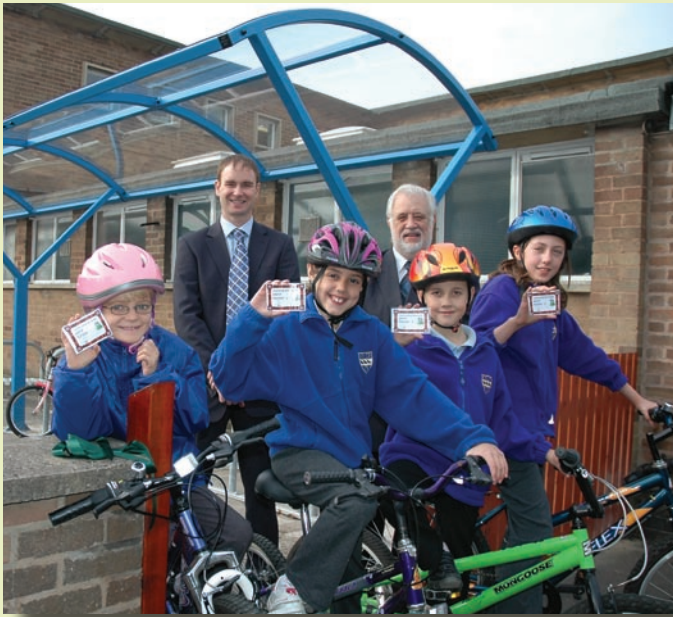
Langmoor Primary School, Oadby